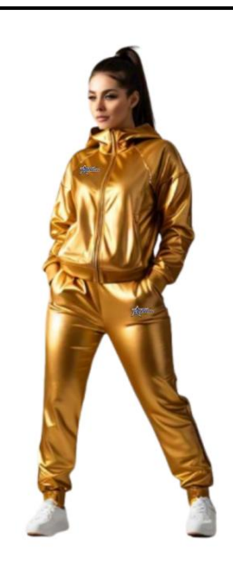
Women's Sweatsuits 2 Piece Fleece Triple Shade Travel Tracksuit Outfits Long Sleeve