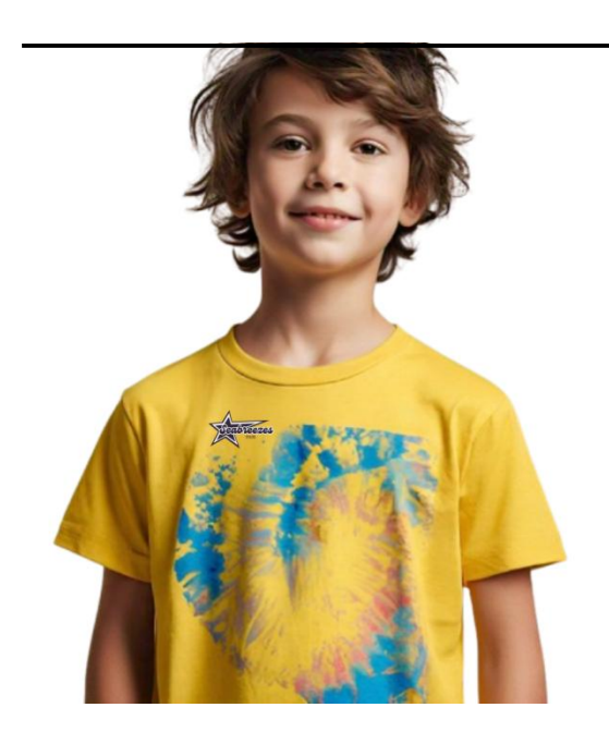
The Children's Place Boy's Basic T-Shirt