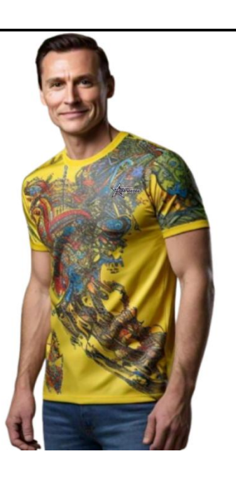
Men's Printed Short Sleeve T-Shirts Casual Graphics