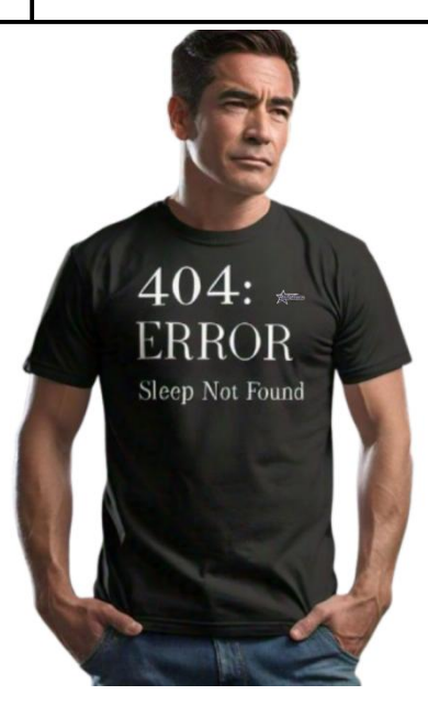
Men's Short Sleeve Performance T-Shirt