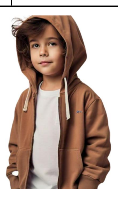
The Children's Place boy's Soft Hooded Full Zip Up