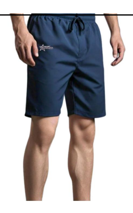
Men's Originals Fleece Sweat Shorts with Pockets