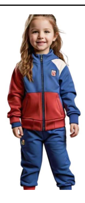
Boy's Tracksuit Jacket & Pants 2 Piece Set