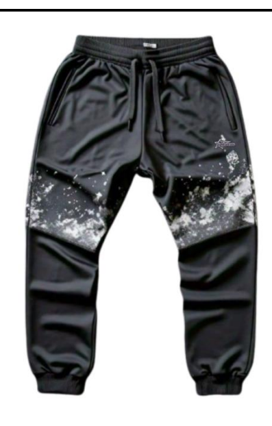
Men's Slim Fit Printed Trouser