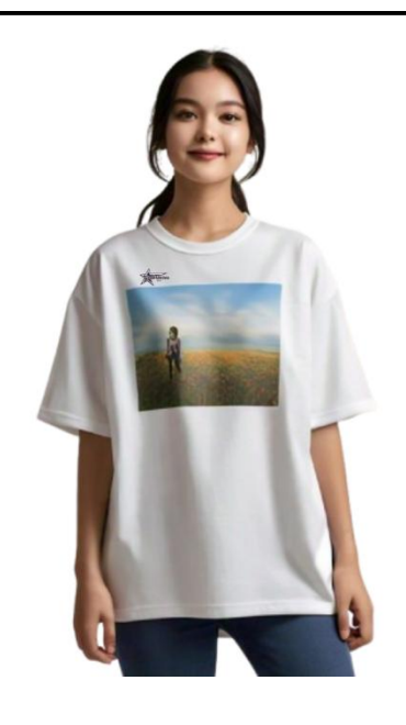
Women's Size Plus Graphic T-Shirt