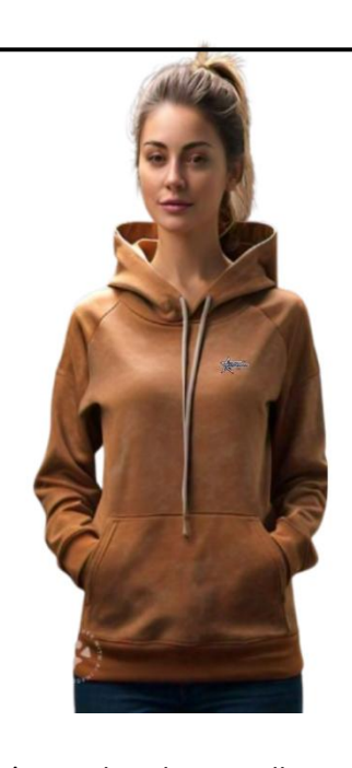
Women's Graphic Fleece Pullover Hooded Sweatshirt