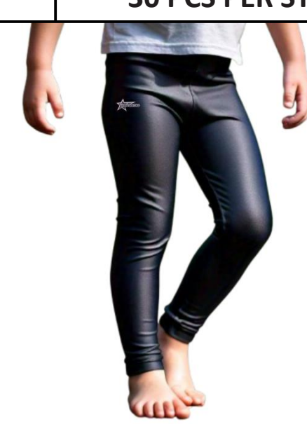
Children's Leather Legging Wet Look Shiny Metallic Legging