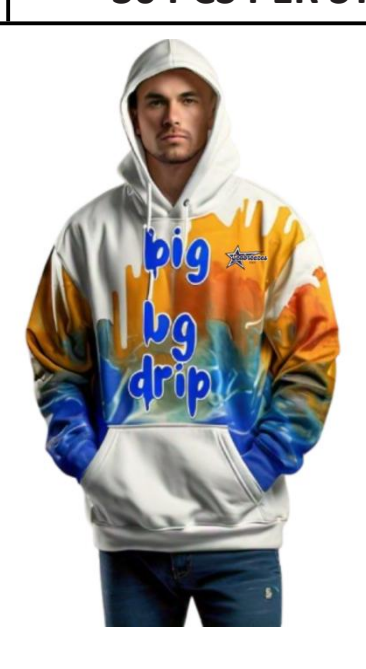
Graphic Hoodie For Men Oversized