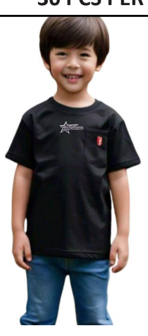
The Children's Place boy's Basic Short Sleeve Tee