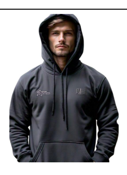
Black Hoddie Cotton Fleece Fabric