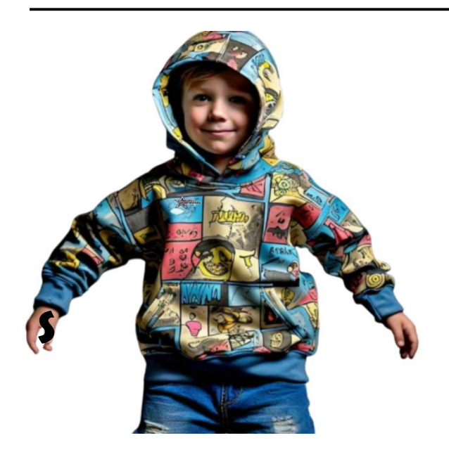
Boy's Fleece Hooded Pullover Sweatshirt