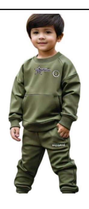
Boy's Sweatsuit 2 Piece Performance Fleece Tracksuit