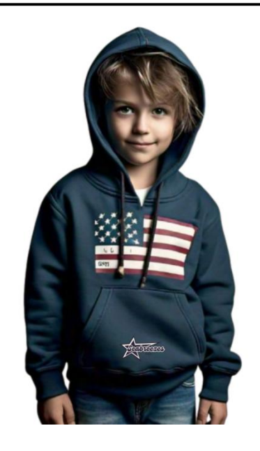
Boy's Hoodie Fleece Pullover Logo