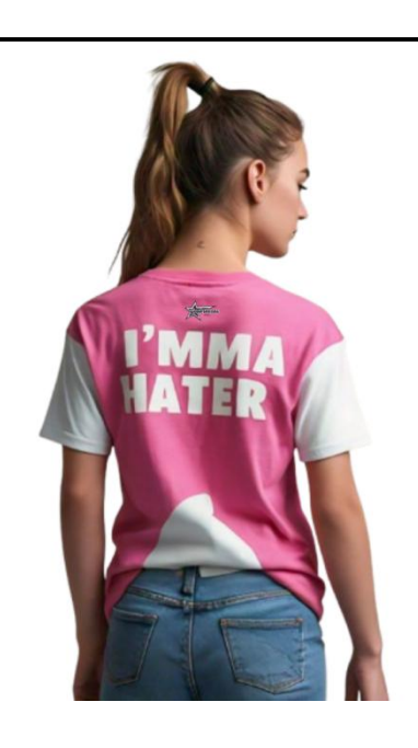
Sweatshirts for Women's Fashion Women's Printed Classic Short Sleeve Women's Classic-Fit Short-Sleeve Round Neck