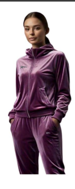
Plain Shinny Velvet Tracksuit