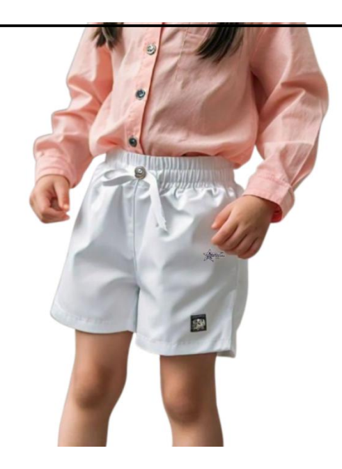
Women's Quick-Dry Running Shorts with Pockets