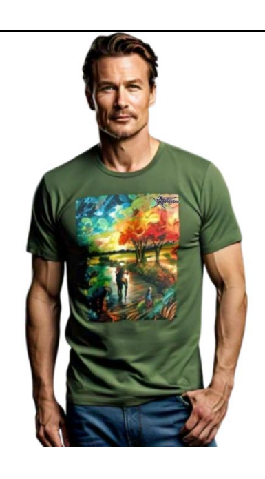
Men's Casual Short Sleeves Classic Fit T-Shirt