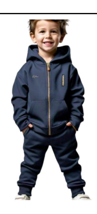
Kid's Plain Tracksuit Cuffed Casual Fashion