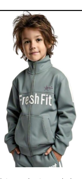
Kid's Plain Tracksuit Hooded Hoodie