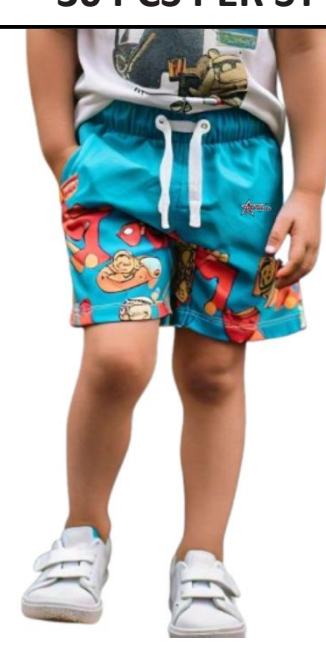
Womens Luxury Clothing Shorts Comfortable & Stylish