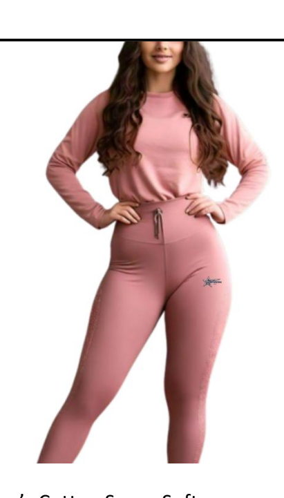
Women's Cotton Super Soft Stretch Legging