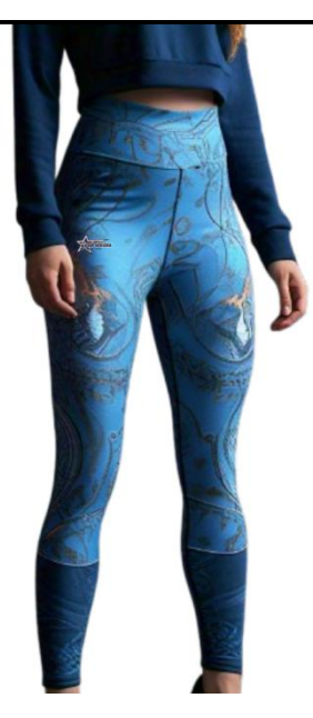
Women's Full-Length Printed Legging