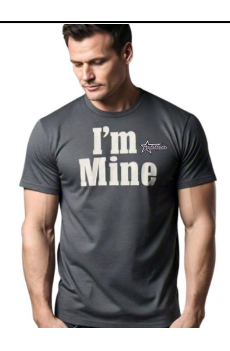
I'm Mine Men's T-Shirt, Classic Graphic T-Shirt