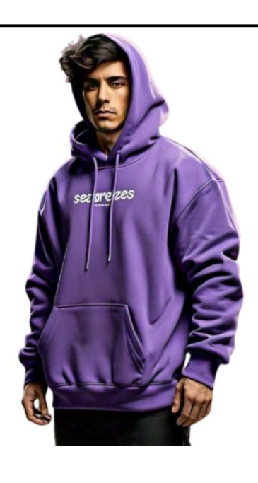
Men's Fleece Hoodie Warm Clothing