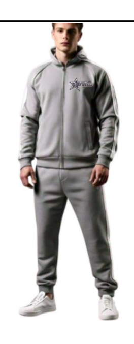
Men's Pullover Casual Tracksuit Sweatshirt