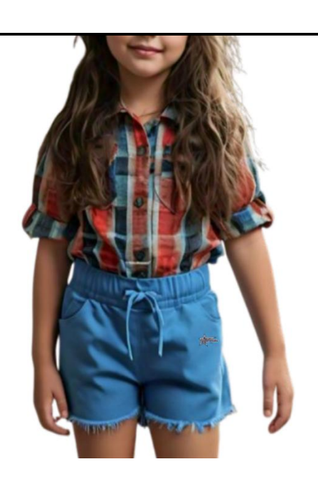
Women's Comfort Cotton Solid and Novelty Short