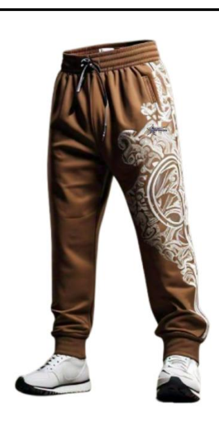
Branded Men's Running Trouser