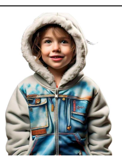
Boy's Comfortsoft Full-Zip Long Sleeve Hoodie