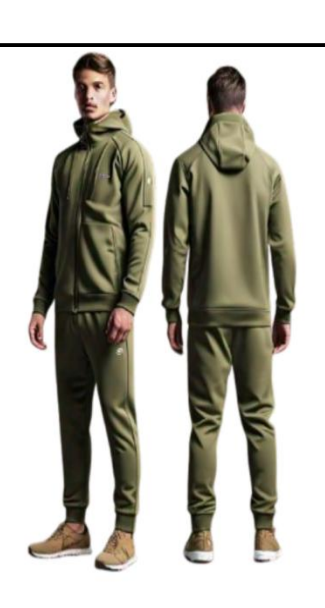
Men's Hoodies Sweatshirt Pullover With Pocket Tracksuit