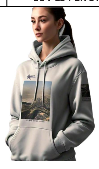
Women's Originals Pullover Hoodie, Midweight Fleece