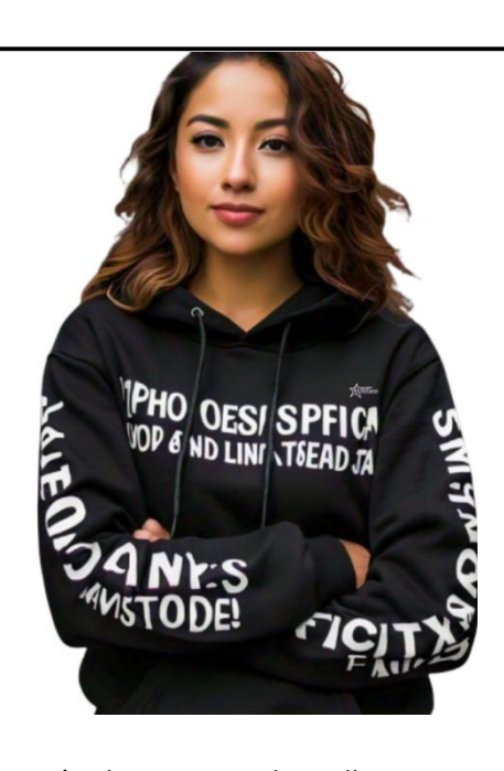
Women's Plus Size Hoodie Pullover Tops with Pocket