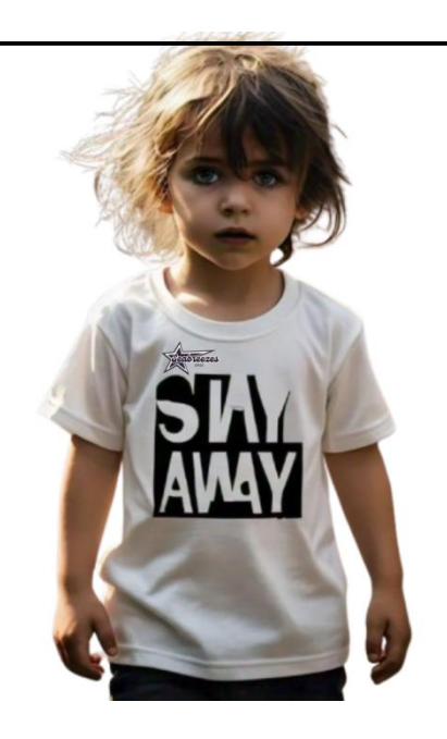
The Children's Place Girl's Short Sleeve Graphic T Shirt