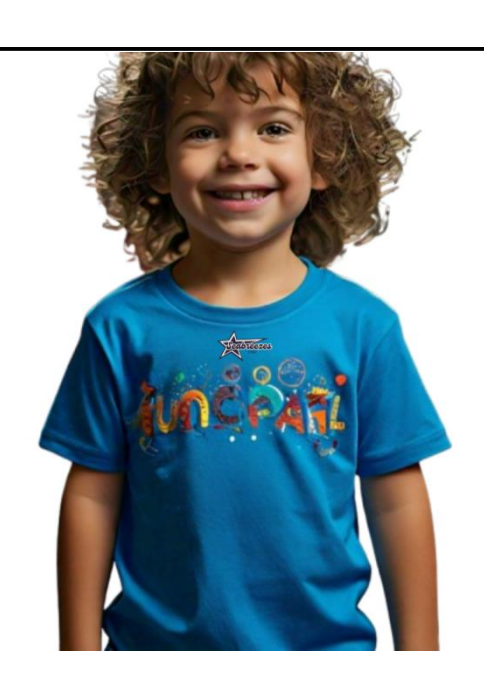
Boy's Short Sleeve T-Shirt Crewneck Lightweight