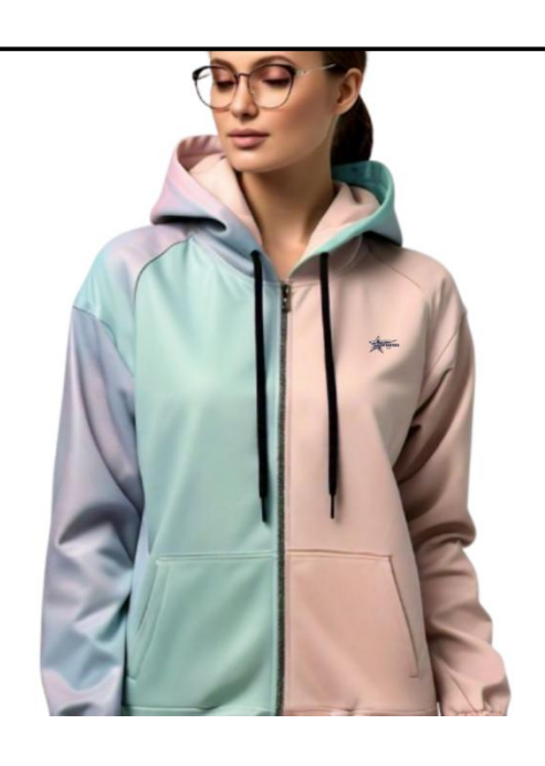
Women's Hoodie Fleece Full-Zip-up Hooded Sweatshirt