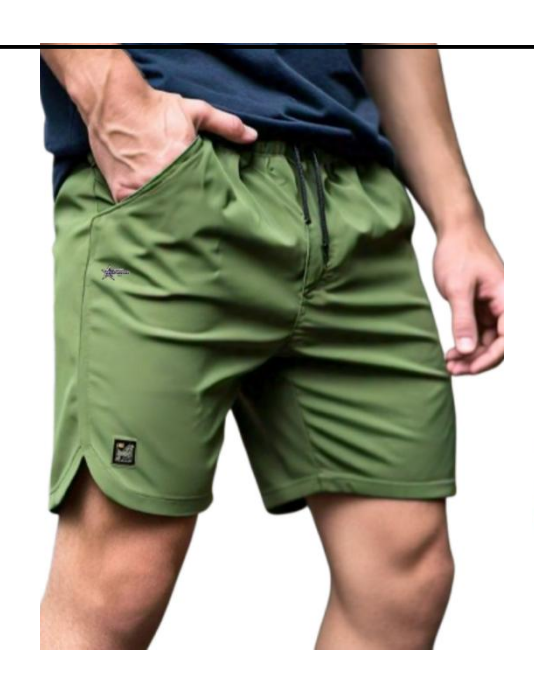
Men's Slim-Fit 7 Chino Short