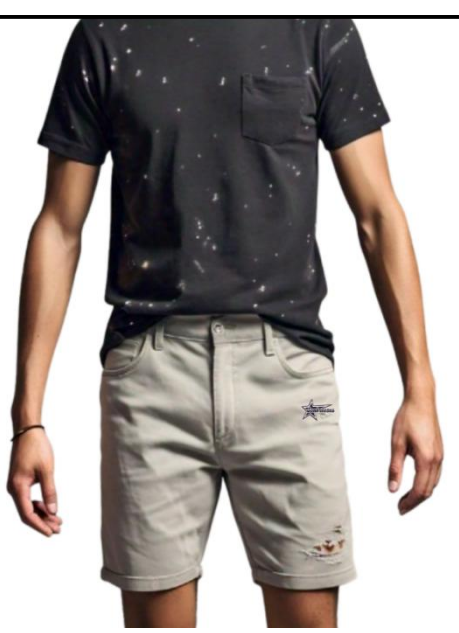
Men's Classic Fit Short Lightweight, Adjustable Waist